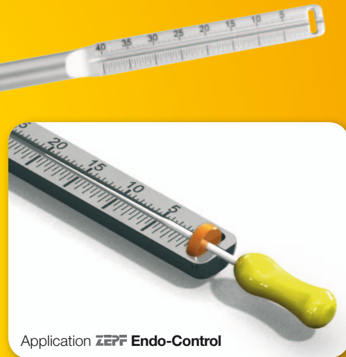
Application ZEPF Endo-Control